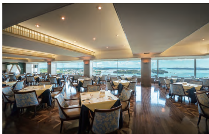
Main Dining Shiosai