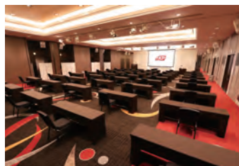
Grand Hall Etoile