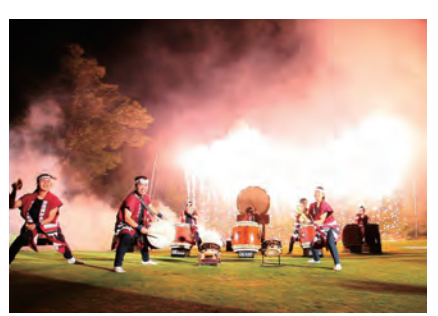
Garden scene 2