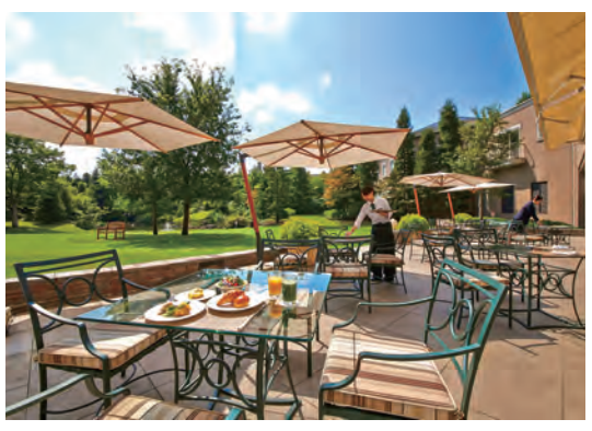
All-Day Dining Chef's Terrace