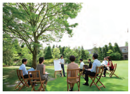
Garden scene 1