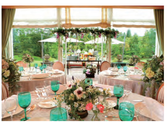
Garden Banquet "Mon Cheri"