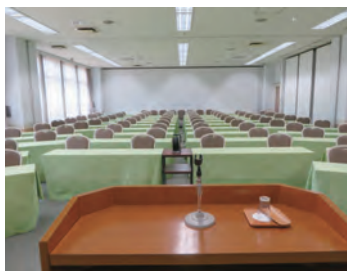
Medium Meeting Room