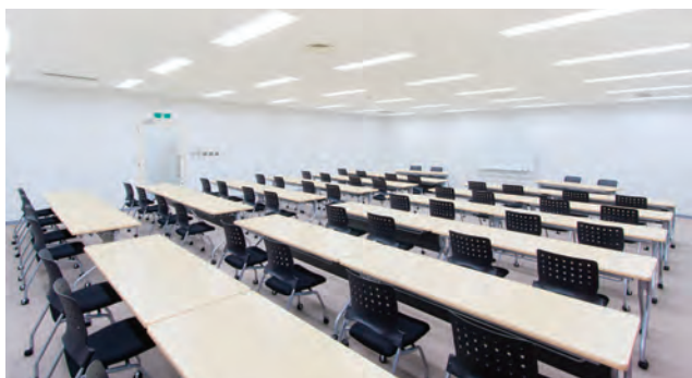
Special Meeting Room