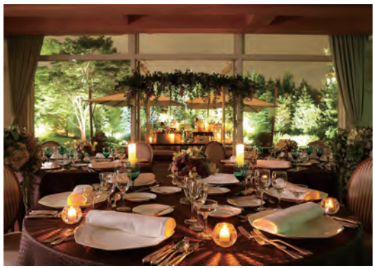
Garden Banquet Mon Cheri