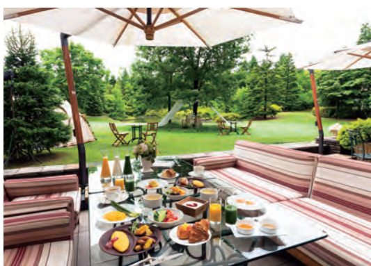
Garden Restaurant "CHEF'S TERRACE"