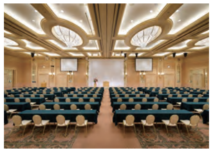
Royal Hall (school)