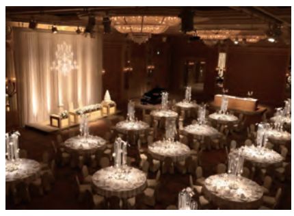
Royal Hall (party)