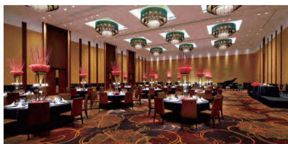
GRAND BALLROOM (party)