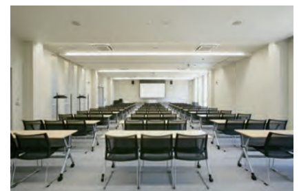
Meeting Room 3