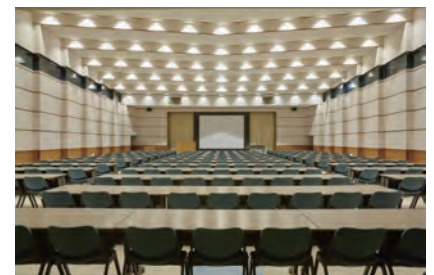
Tachibana Conference Hall